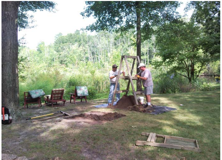
Volunteers at Hogge Site on July 29, 2009