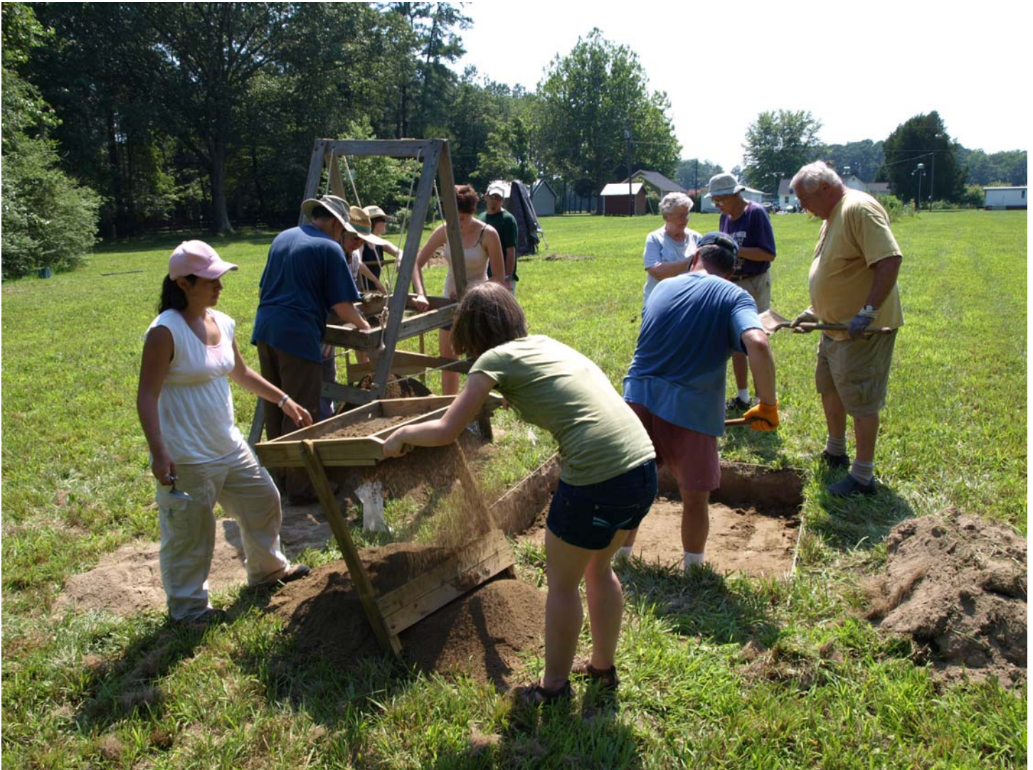
Interns and ASV members at Bailey Site

In 2009 the Middle Peninsula Chapter of the Archeological Society of Virginia (MPCASV) continued working on several projects with the Fairfield Foundation. The Fairfield Foundation is a not-for-profit research organization focusing on the archaeological study of the Burwell family plantation in Gloucester County, and on involving and educating the public in the process of archaeology and the value of historic preservation activities.