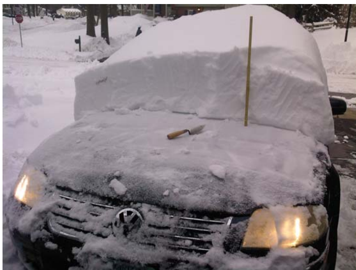
Excavating the car!

Mother Nature is not cooperating with archaeologists this winter. However, that said, tell your neighbor now that they have finally learned how to use a shovel, maybe they would like to put that new found knowledge to use and join the Archeological Society of Virginia!!!