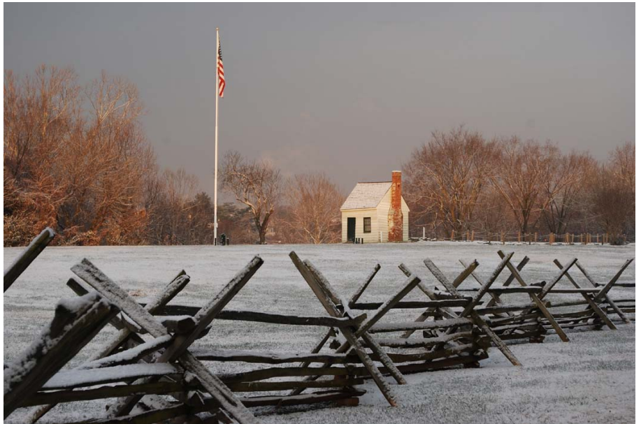
Winter at Ferry Farm

For more information on ASV go to: http://www.asv-archeology.org